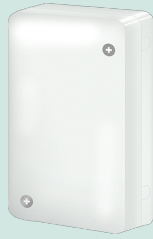
CZ-CAPRA1 RAC interface adapter for integration into P Link