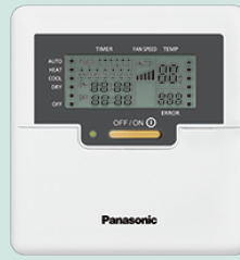
Wired Remote Control CZ-RD514C