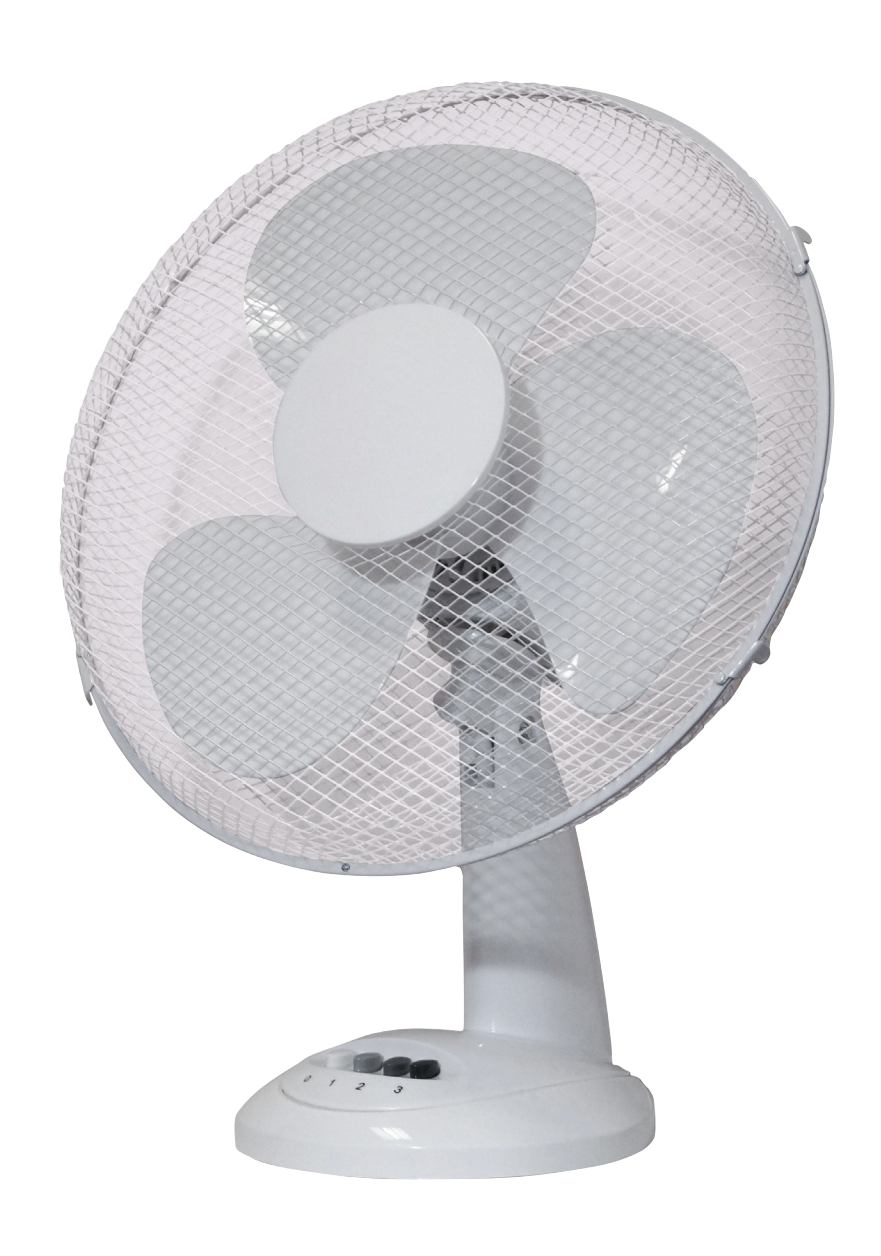
User Manual Please Retain for Future Reference

Prem-I-Air 16" (40 cm) White Oscillating Desktop Fan with 3 Speed Settings