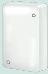
CZ-CAPRA1 RAC interface adapter for integration into P Link